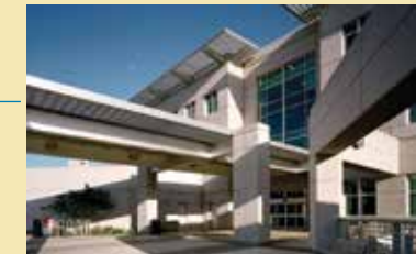
Lawrence J. Ellison Ambulatory Care Center