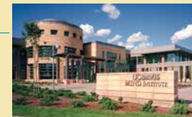
UC Davis MIND Institute